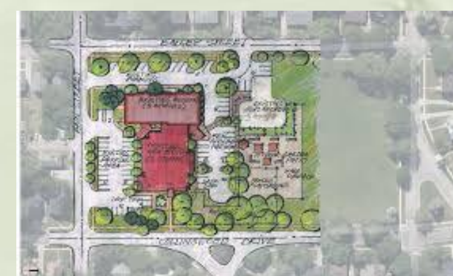
Concept of a new community center for the David Ewalt Center.