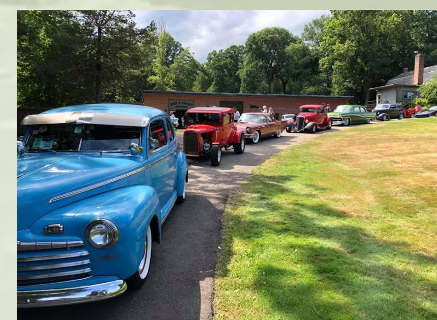
Classic cars at the Jack Frost Auto Museum.

Beaudette Park. Recommendations for this park include: • As host, self-promote during Woodward Dream Cruise • Host more family-centered events • Enhance resident access to park amenities