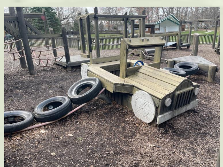
Playground equipment idea for automobile themes.