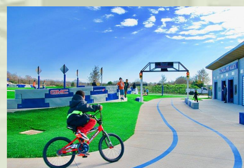
Design renderings of a bicycle track.

Aaron Perry Park Recommendations for this park include: • Decorate with car part replicas (GMC and Chevrolet) • Sports car themed playground • Add concession stand or designate an area for food vendors