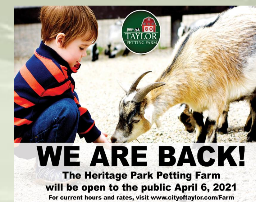
Petting zoo as an example of hosting more family-center events.