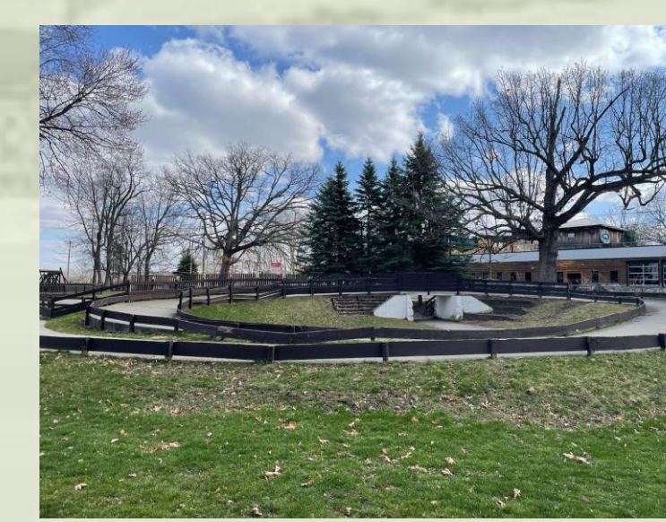
Bicycle track Case Study: Lake Lansing Park South.