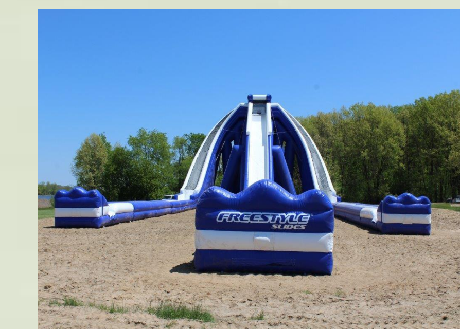
Water slide Case Study: The inflatable Trippo Water Slide.