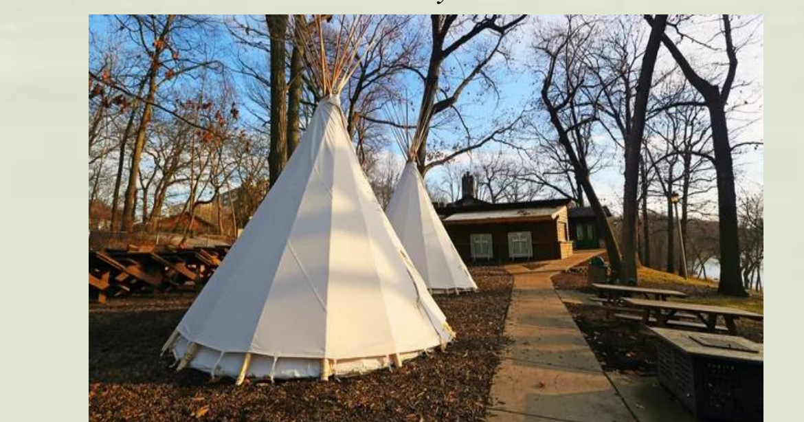
Warming hut Case Study: Hubbard Park Lodge