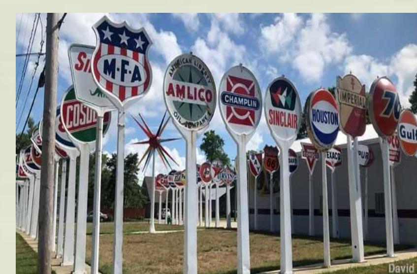
Vintage gas station signs idea for mile markers.