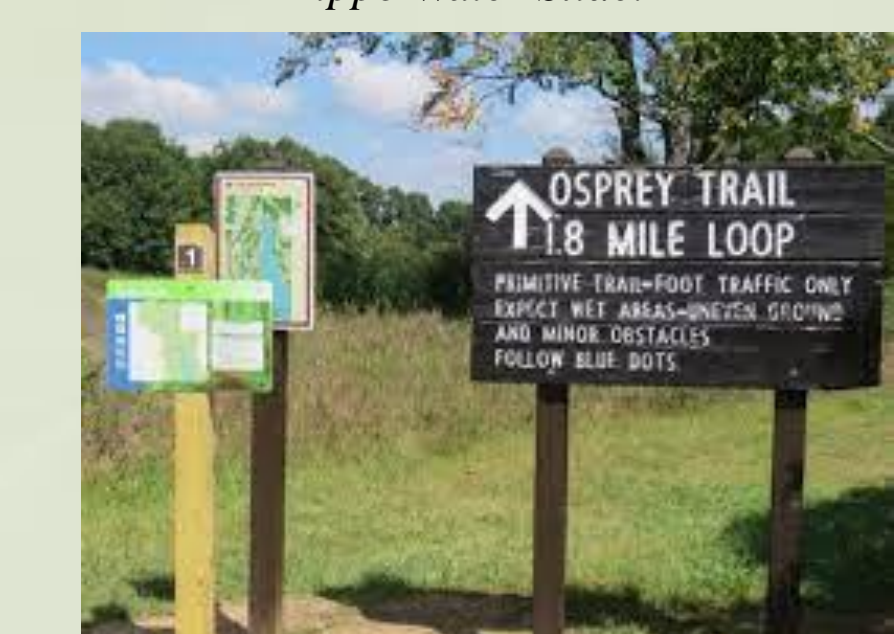
Signage to add for non-motorized bike paths.